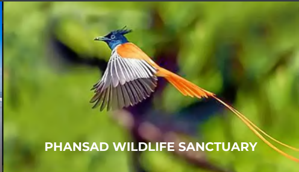
PHANSAD WILDLIFE SANCTUARY