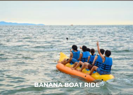
BANANA BOAT RIDE